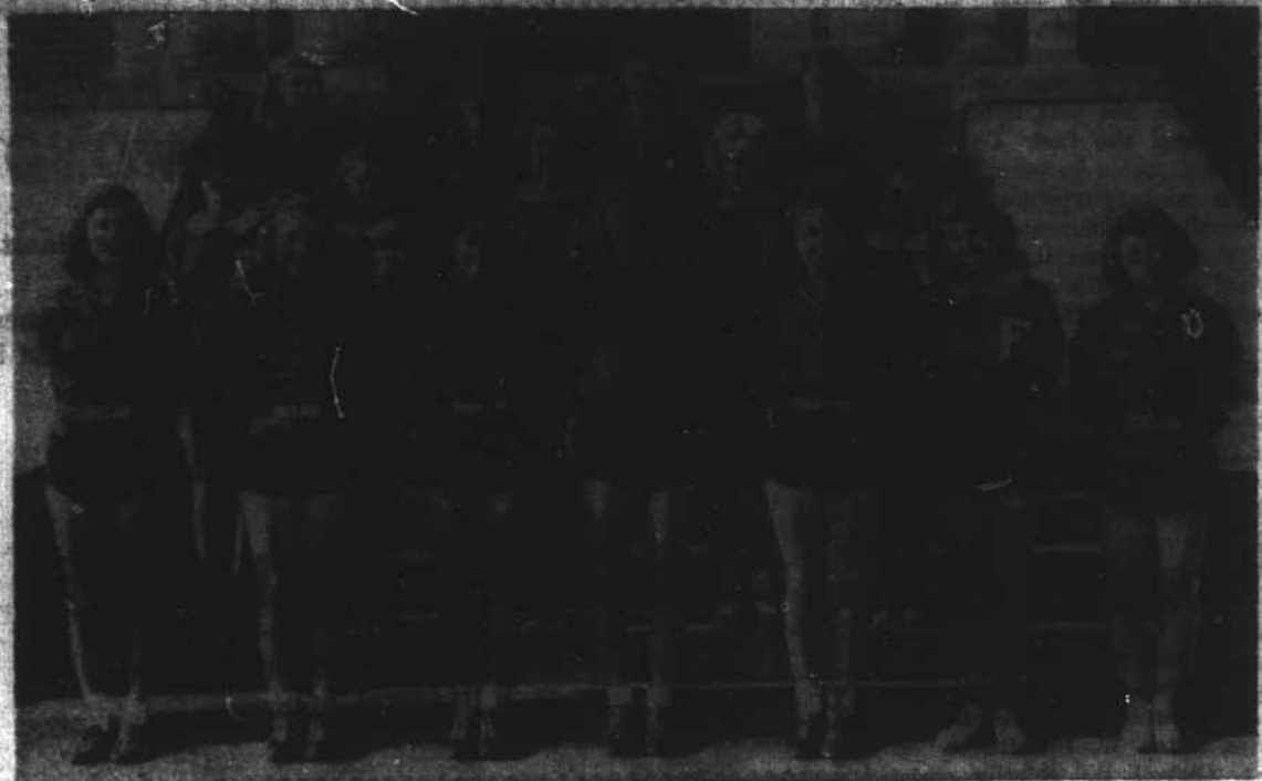
FARMVILLE HIGH SCHOOL GIRLS BASKETBALL TEAM