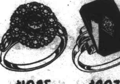
Ladies' diamond onyx ring in an exquisite pattern.