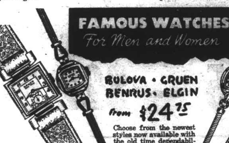
styles now available with the old time dependability. There is no additional charge for credit.

The lighter everyone is raving about! Smart . . . handsome . . . dependable.