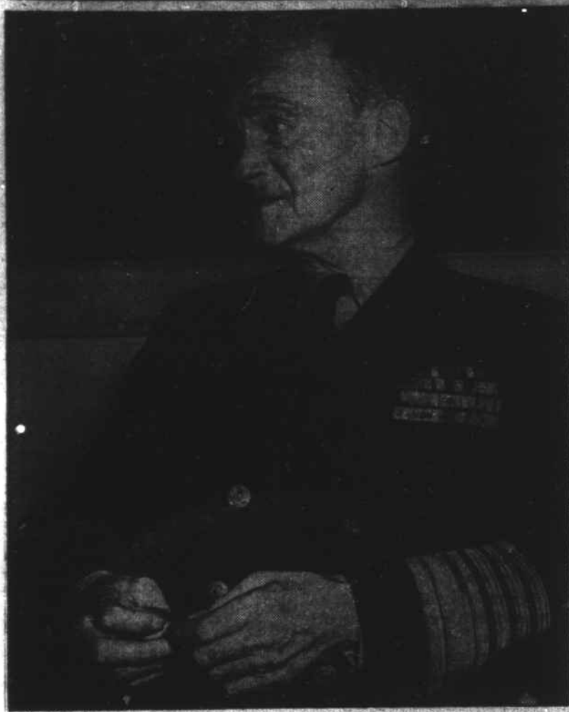
Admiral Marc A. Mitscher, USN, Commander of the new Eighth Fleet, announces extensive maneuvers in the Western Atlantic and Caribbean areas, April 19, to May 27, at a news conference at the Navy Department in Washington, D. C. A total of 29 ships, including the USS Missouri and the new super-carriers, Franklin D. Roosevelt and Midway, will take part in the maneuvers, described as the most extensive to be held in the Atlantic since 1939. As stories of local men taking part in these maneuvers are received from the Fleet by the Fleet Home Town News Center in Chicago, they will be edited and distributed to home town newspapers.