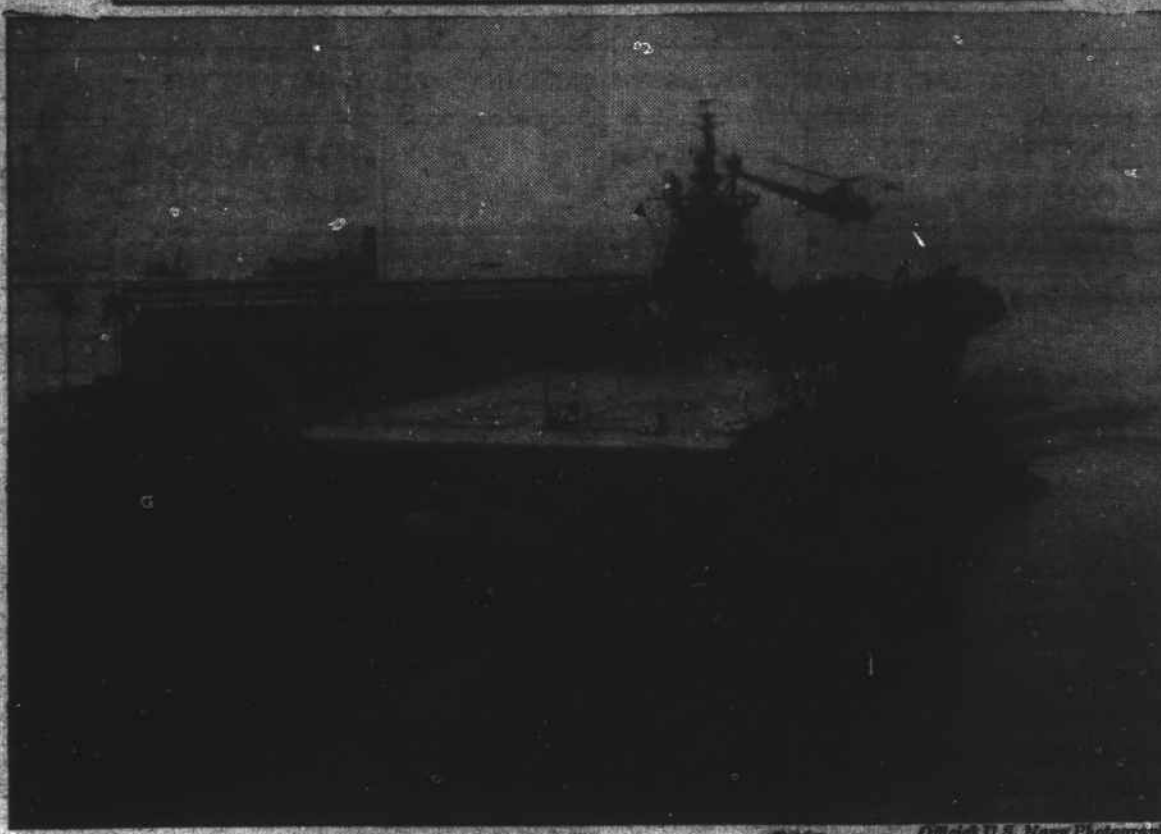
WINDMILL OVER A FLATTOP —One of the helicopters that will be used by Joint Army-Navy Task Force One at Bikini hovers just above the deck of its mother ship, the carrier USS Shangri-la. When this photograph was taken the Shangri-la was headed through the Panama Canal en-route to the Pacific. Helicopters will be used to make radiological reconnaissance patrols in the lagoon after the blast.