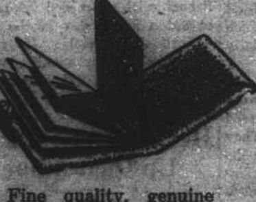
Fine quality, genuine leather wallet $6.00 up