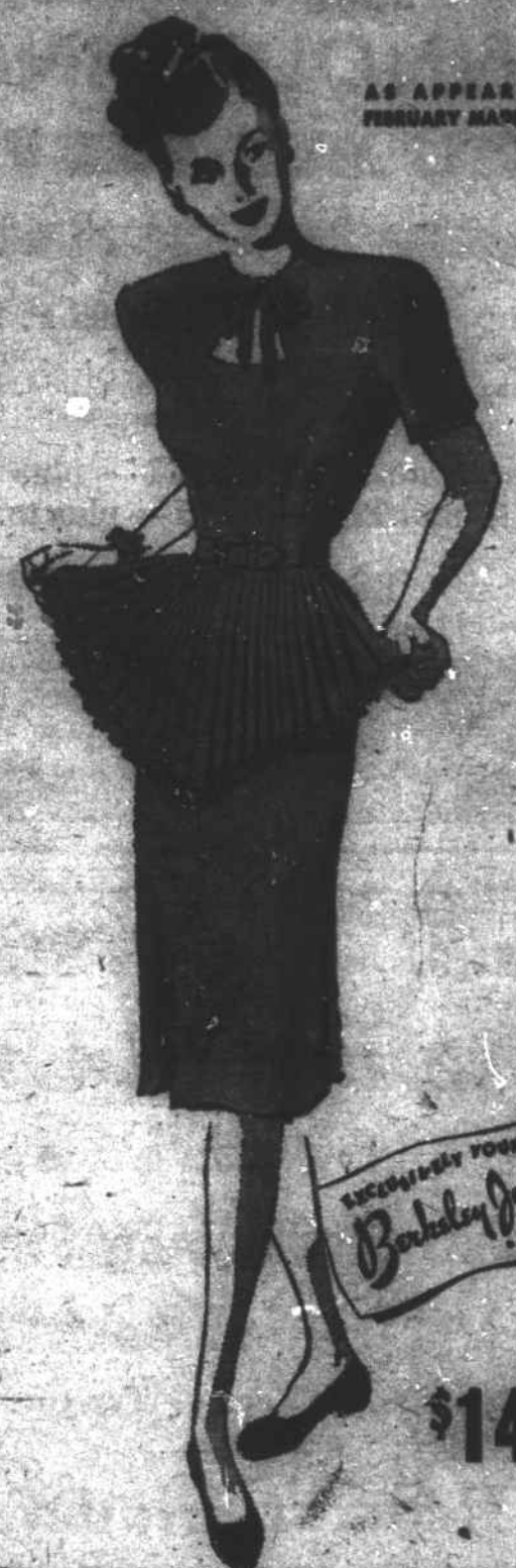
AS APPEARING IN FEBRUARY MAGAZINE