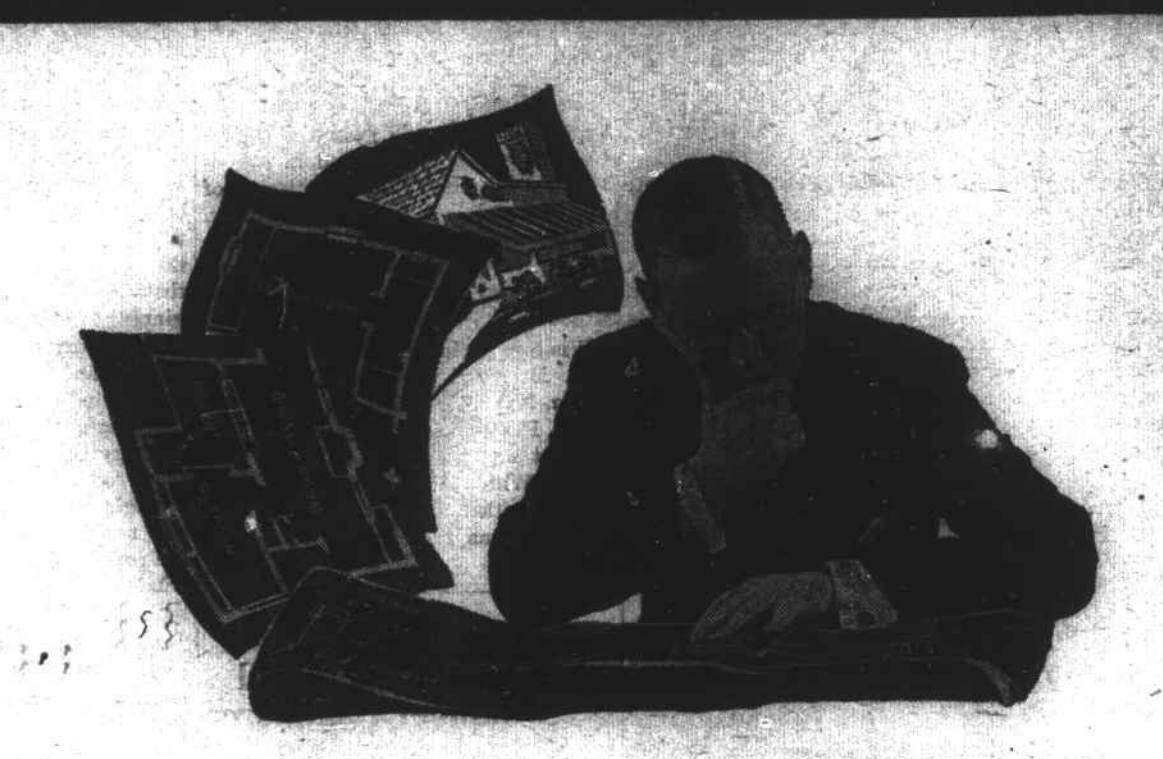
Good Blueprints Assure You A Beautiful Home A Good Mortgage Assures You A Home Of Your Own

No matter how carefully you plan your home—from the blueprint stage until it's finally finished—only carefully planned mortgage can give that home to you. Let our expert home financiers plan that mortgage for you. Make sure the mortgage on your home is of the "self-paying" type which will lead to a clear title to your home at the end of a stated number of years. Come in to see us about the home you intend to buy or build, or the repairs that you want to make on your present home.