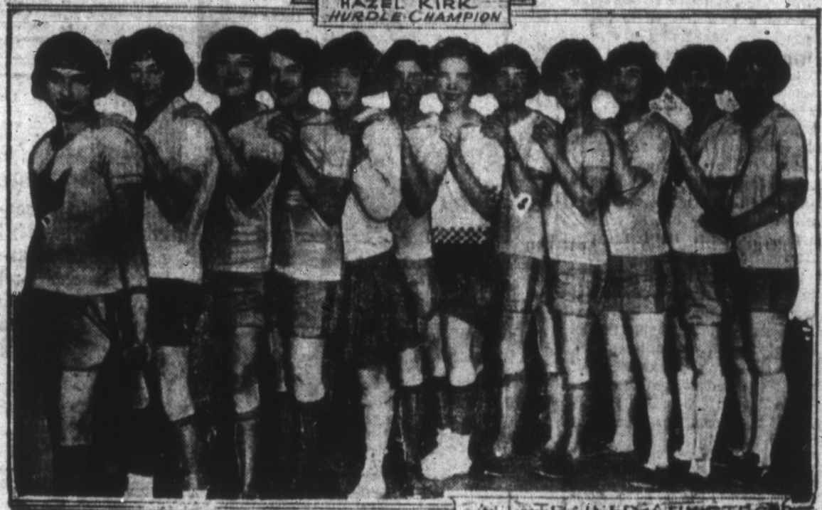
AT TRAINING SESSION