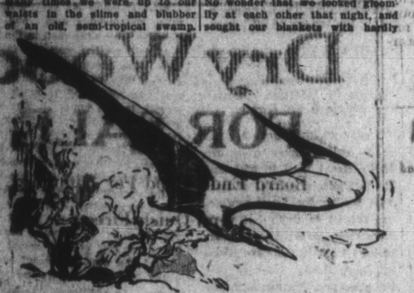
The whole group of us were covered for an instant by a canopy of leathery wings.