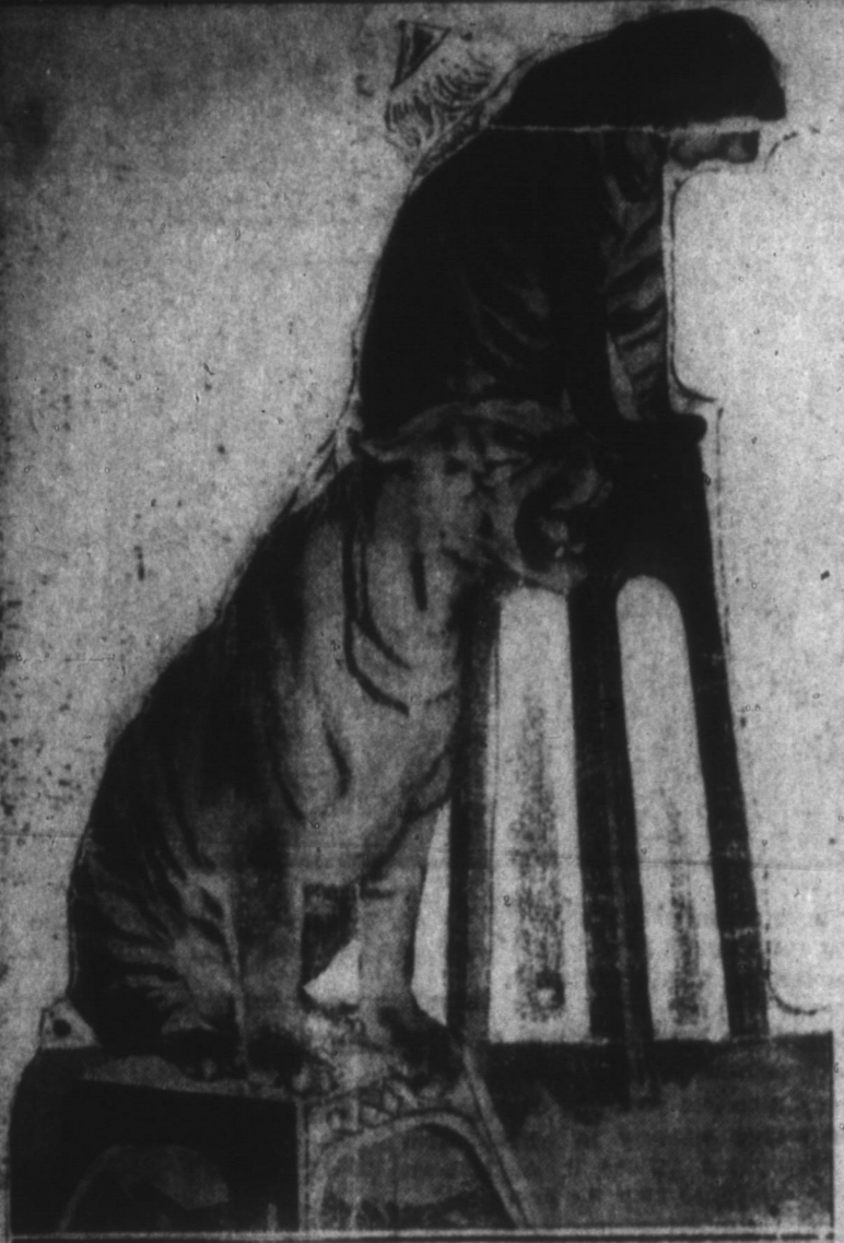
John Robinson's Circus is coming.

For over a hundred years that statement, spoken by your great grandfather, your grandfather and your father in the days when they looked on the world through youthful eyes, has stood for much in the John Robinson's Circus. It is coming way of eager anticipation. And now to you—coming Saturday October 3, for parade that forenoon and afternoon and night performances.