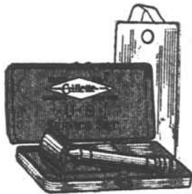
The New U. S. Service Set—A solid metal case, heavy nickel-plated and embossed with the insignia of the U. S. Army and Navy. Strong, thin, compact: 1 3/4 inches wide, 4 inches long, 3/4 inch thick. 12 double-edged Gillette Blades (24 Shaving Edges). Contains a nickel-plated Gillette Safety Razor and Blade Box. Indestructible Trench Mirror inside the lid. $5