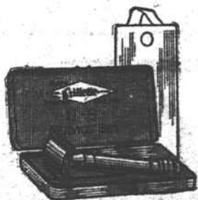
The New U. S. Service Set—A solid metal case, heavy nickel-plated and embossed with the insignia of the U. S. Army and Navy. Strong, thin, compact 1 1/2 inches wide, 4 inches long, 3/8 inch thick. 12 double-edged Gillette Blades (24 Shaving Edges). Contains a nickel-plated Gillette Safety Razor and Blade Box. Indestructible Trench Mirror inside lid. $5