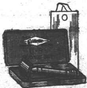
The New U. S. Service Set—A solid metal case, heavy nickel-plated and embossed with the insignia of the U. S. Army and Navy. Strong, thin, compact: 1 3/4 inches wide, 4 inches long, 3/4 inch thick. 12 double-edged Gillette Blades (24 Shaving Edges). Contains a nickel-plated Gillette Safety Razor and Blade Box. Indestructible Trench Mirror inside lid. $5