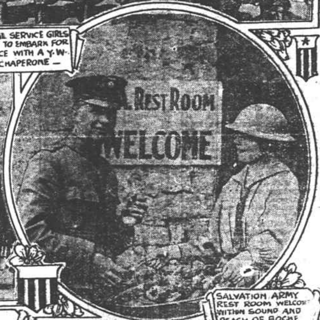
SALVATION ARMY REST ROOM WELCOME WITHIN SOUND AND REACH OF BOICHE GUNS.