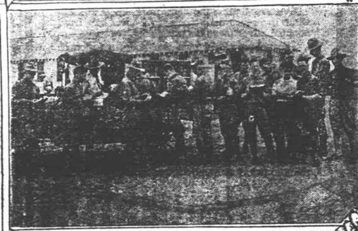
HERE IS ONE OF THE MANY READING ROOMS ESTABLISHED AMONG OUR MEN IN KHAKI BY THE JEWISH WELFARE BOARD.