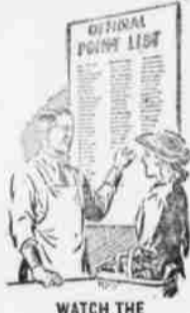
WATCH THE OFFICIAL TABLE OF POINT VALUES

7. The Government will set the points for each kind and size and send out an Official Table of Point Values which your grocer must put up where you can see it. The Government will keep careful watch of the supply of these processed foods and make changes in point values from time to time, probably not often than once a month. The Government will announce these changes when it makes them and they will be put up in the stores.