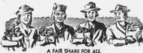
A FAIR SHARE FOR ALL

You may use ALL the books of the household to buy processed foods for the household. Anyone you wish can take the ration books to the store to do the buying for you or your household.