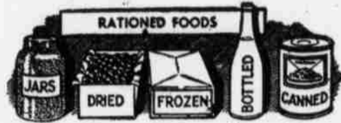
RATIONED FOODS Fruits, Vegetables, Soups, Juices, Beans, Sausages, Chili Sauce, Baby Foods, etc.

5. You must use the BLUE stamps when you buy ANY KIND of the rationed processed foods. See the official list, showing every kind of rationed processed food, at your grocers. Different kinds of these foods will take different numbers of points. For example, a can of beans may take a different number of points from a can of peas.