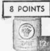
YOU GIVE LESS POINTS FOR FOODS THAT ARE NOT SO SCARCE

2. Before you buy, find out how many points to give for the kind of processed foods you want. Prices do not set the points. The Government will set different points for each kind and size no matter what the price. Your grocer will put up the official list of points where you can see it. It will also be in the newspapers. The points will not change just because the prices do.