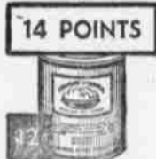
YOU GIVE MANY POINTS FOR SCARCE FOODS

1. The Government has set the day when this rationing will start. On or after that day, take your War Ration Book Two with you when you go to buy any kind of these processed foods.