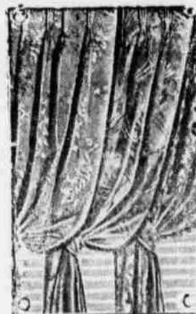
Fancy crash and damask floral designs. Fringed

SOFA PILLOWS, each - - - 59c Silk rayon covered printed floral Fringed