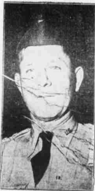
NEW EUROPEAN COMMANDER —Lieut. Gen. Jacob L. Devers, newly appointed commanding general of United States Forces in the European theater of operations, is a native of York, Pennsylvania. He was appointed to the U. S. Military Academy in 1905, and upon his graduation in 1909 was commissioned a second lieutenant of field artillery. He filled important assignments in the field artillery and on the General Staff. In July, 1941, he was assigned as Chief of the Armored Forces, Fort Knox, Kentucky, and in May of this year was assigned to his present command.

The statement emphasizes that the figures summarized show increases over 1942 only. "In 1942, supervised FSA borrowers constituting only 7.6 per cent of all farmers in the United States, produced 36 per cent of the entire increase in milk production, and accounted for at least one-tenth of the entire increase in the production of beef, dry beans and peanuts for that year," it was pointed out.