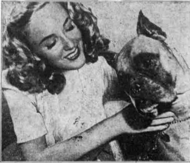
BEAUTY AND THE OPPOSITE. It's lovely Georgia Carroll, who has a top role in Kay Kyser's forthcoming musical, "Around the World." The dancing star is seen with a pet just off the RKO Radio stage.