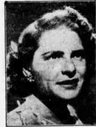
Margaret Bourke-White, globe trotter and famous photographer, who has just finished a stint for Samuel Goldwyn doing special shots of his production "The North Star."

member of the Wilmington district Solid Fuel Industry advisory committee. The Fayetteville area is composed of Cumberland, Hoke, Sampson, Robeson and Scotland and Bladen counties.