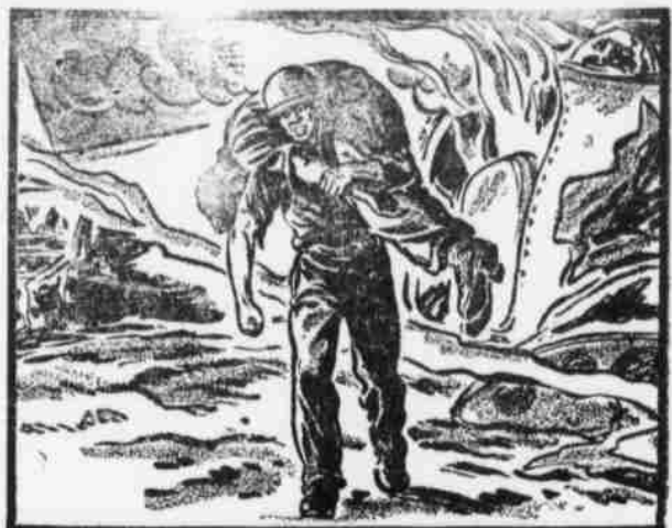
A B-25 was taking off somewhere in North Africa. It crashed and burst into flames. Private Eugene A. Ganter rushed forward with three other soldiers to aid the crew. The heat was overwhelming but Ganter and his companions, drenched from the hoses of rescue apparatus, rescued three crew members from the blazing ship. Then Ganter returned to remove loaded 50 caliber machine guns. He won the Soldier's Medal. Such are the men your War Bonds fight beside.