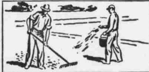
C. In the spring, rake, fertilize and seed as usual.