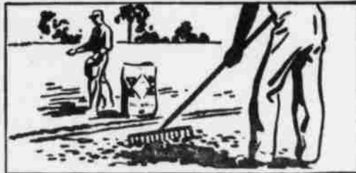
B. Apply Cyanamid at recommended rates.