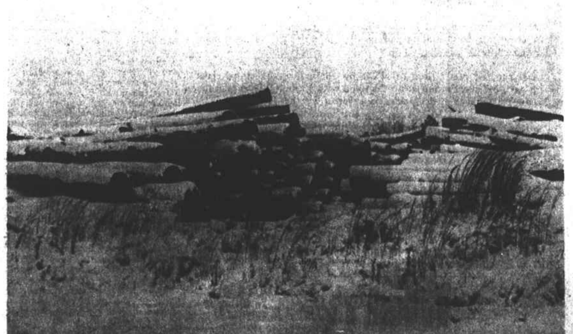
WINTER WONDERLAND-White blanket of snow contrasted with dark bark on logs in small yard on Harmony Heights Road Monday morning. Five inches of snow fell in Raeford closing schools for the day. Snowfall was followed by cold weather, with temperatures plummeting to 18 degrees at 6 a.m. Tuesday.

The vehicle, in good condition, was found about a mile and a half southeast of Raeford in a wooded area near Highland Biblical Gardens. A passing motorist saw the car and reported the location to police, says Police Chief Leonard Wiggins.