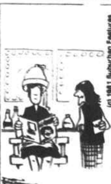
"You'd think that this would be covered by Blue Cross under 'emergency room services'."