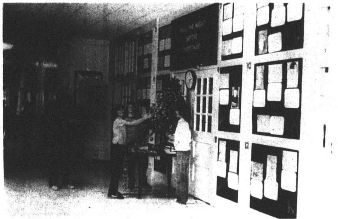
Student-illustrated verses of "Twas the Night before Christmas" decorate the wall behind students decorating the Turlington School Christmas tree.