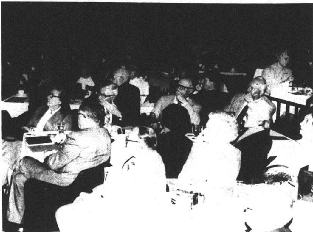
Part of the Raeferd dinner audience of 180 people.