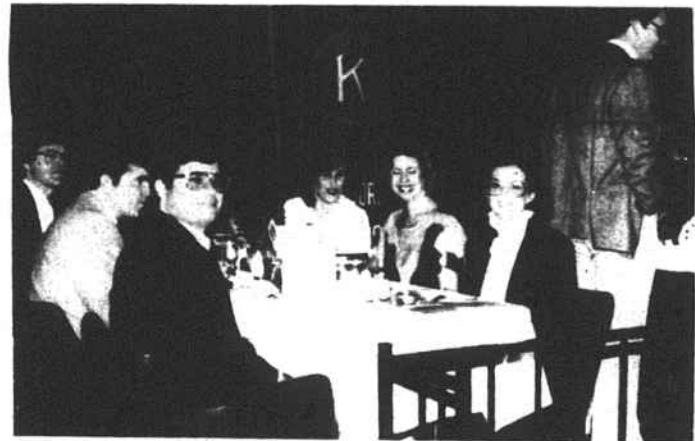
Some of the members and guests at the dinner.