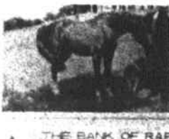
THE BANK OF RAE