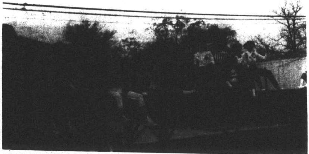
BOOSTING BLAZERS -- These folks are riding in the Saturday morning parade which opened the Celebration of the Arts '82 Hoke County Arts and Crafts Festival. They are boosting the Hoke County Blazers, the Hoke Semi-pro Baseball Association team which is starting its first season.