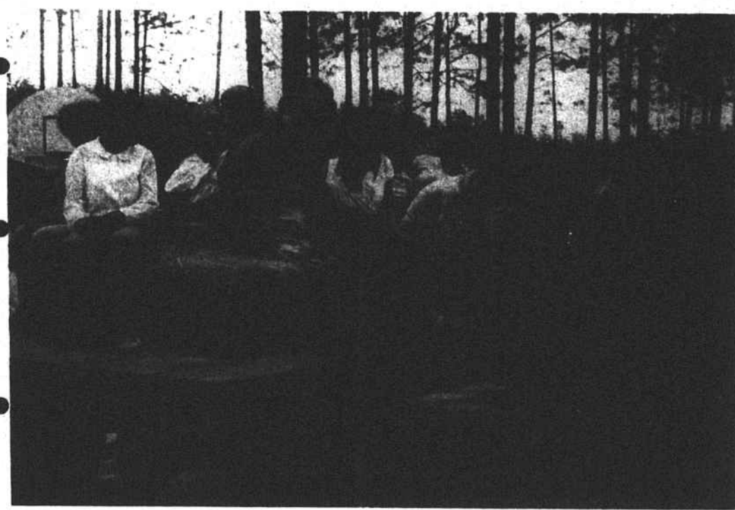
Students and helpers back from a hay ride. Bill Cameron is the driver.