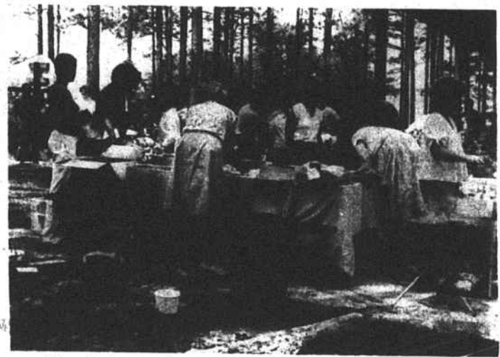
'Chow line' with helpers passing out hamburgers and hot dogs.