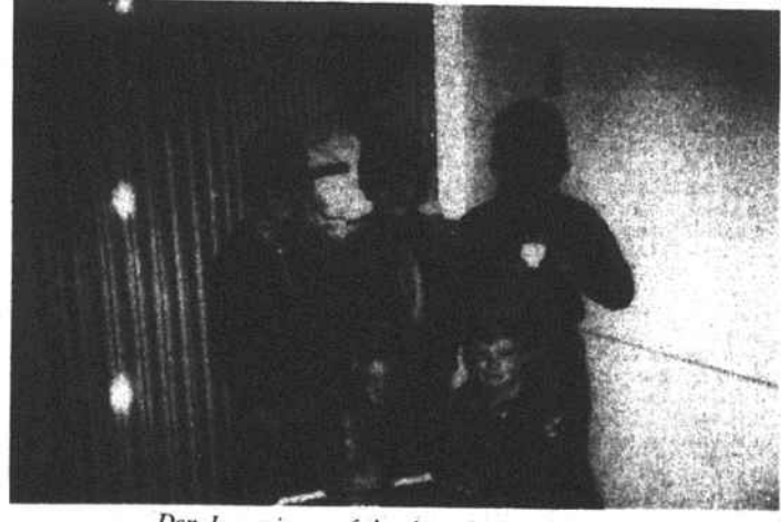
Den 1 ... winner of the Attendance Award