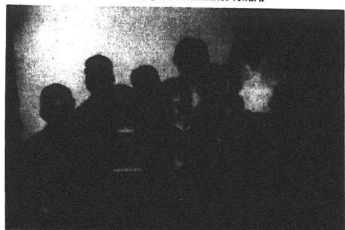
Den 2 ... Den of the Month