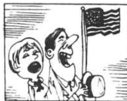
The "Star Spangled Banner," although written in 1814, did not become the national anthem until 1931.

185 W. Morganton Rd. Southern Pines, NC 919/692-7283