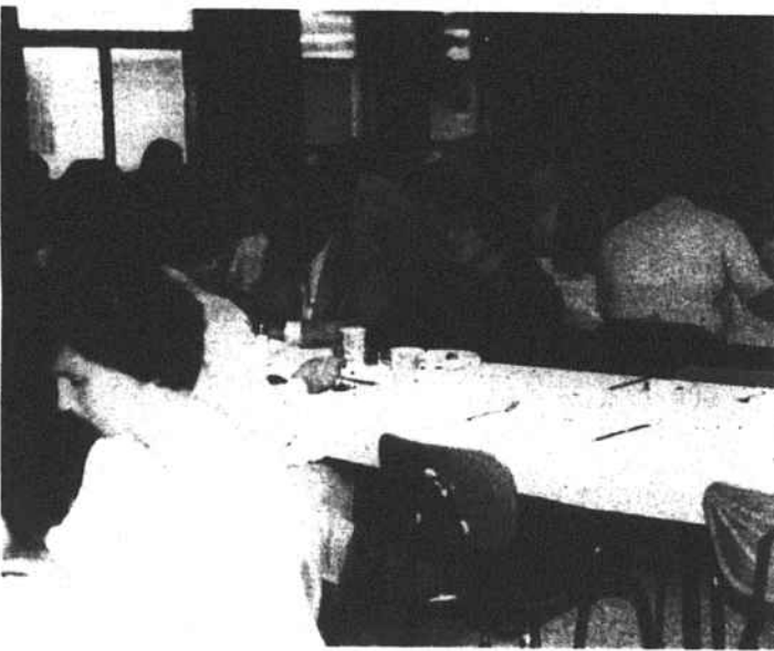
Some of the chamber members and guests at the chamber's annual dinner.