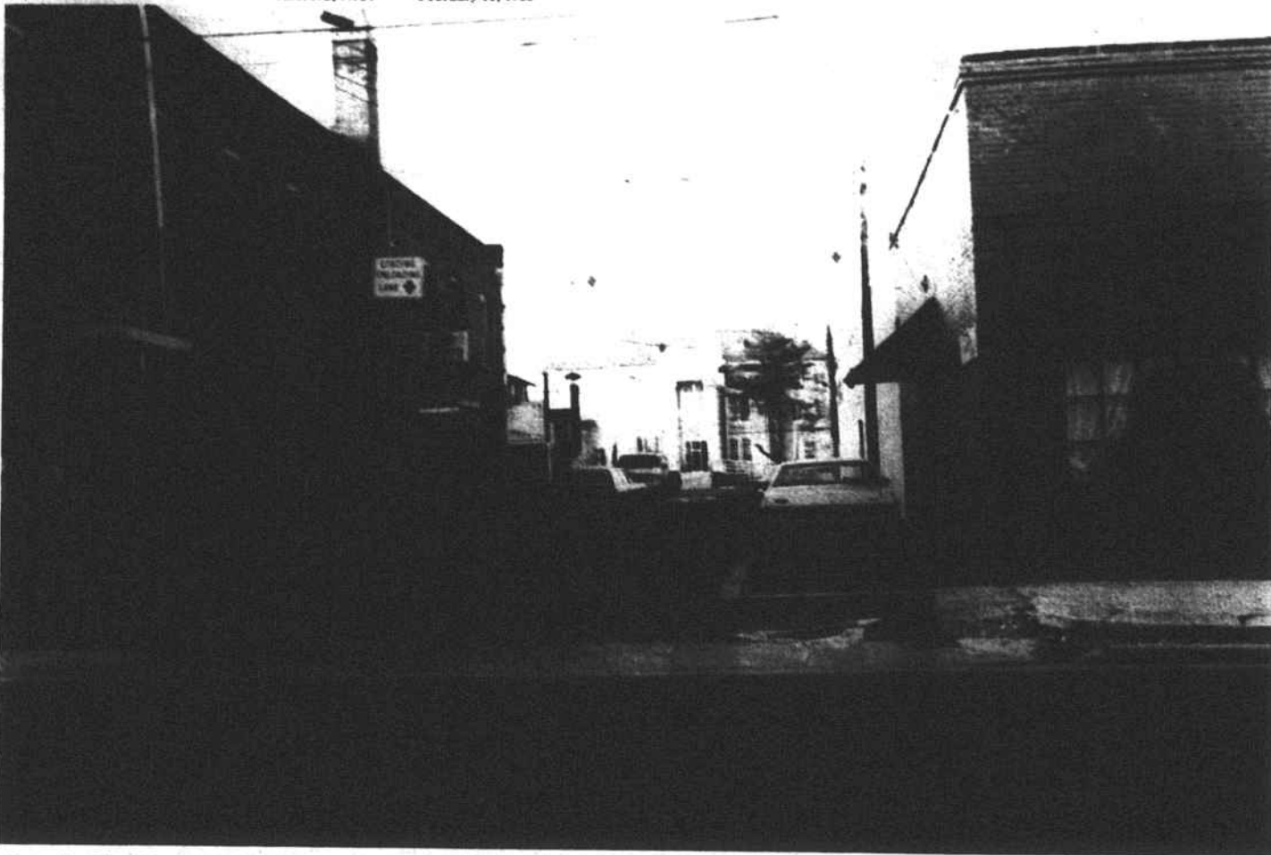
Framed -- This alley behind some Raeford businesses seems to frame the Edinborough Street side of the Hoke County Courthouse.