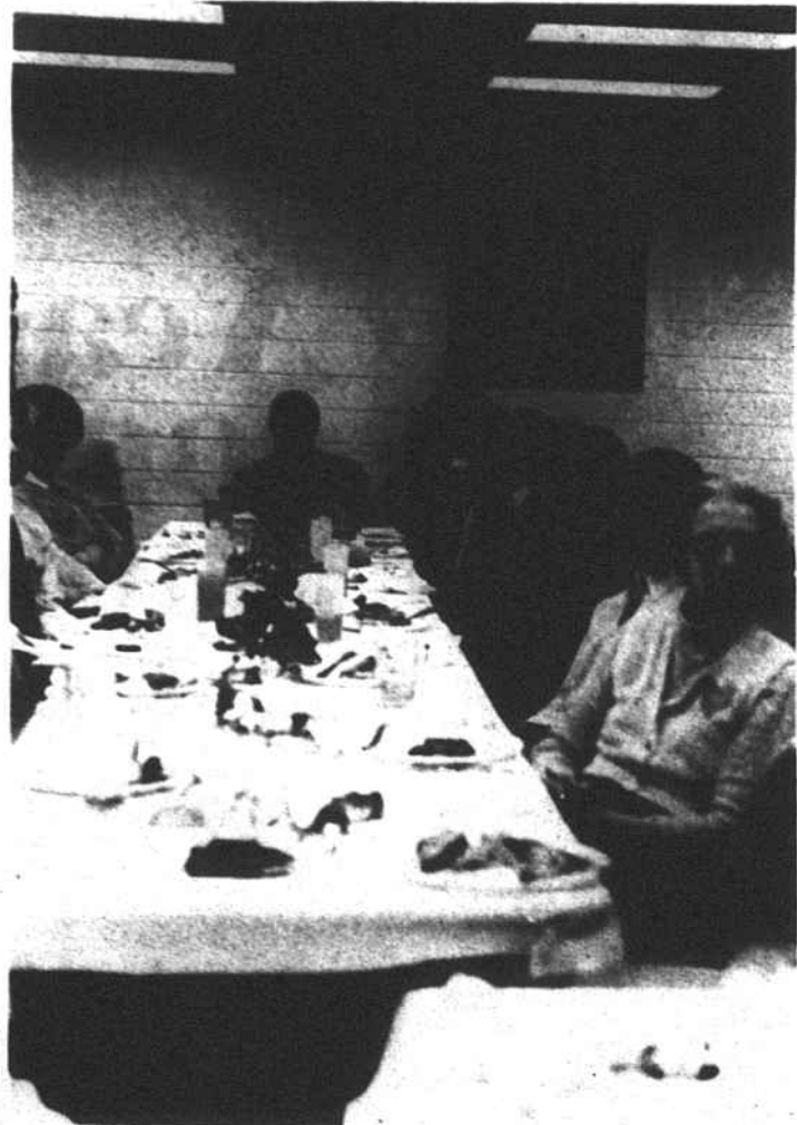
DINNER TREAT --The boys from the Sandhills Youth Center enjoyed a good meal and some good speeches during their graduation ceremony last Monday night.