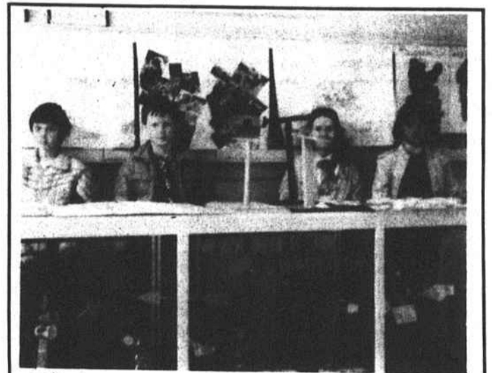
Month of weather

The Varsity boys lost in a close game by a score of 61-65 to E.E. Smith.