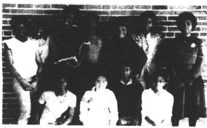
Sixth grade winners Sixth grade girl's champs from Turlington school with their instructor

PHONE FOR FOOD SPECIALS DAILY 875-5752 Wagon Wheel Restaurant