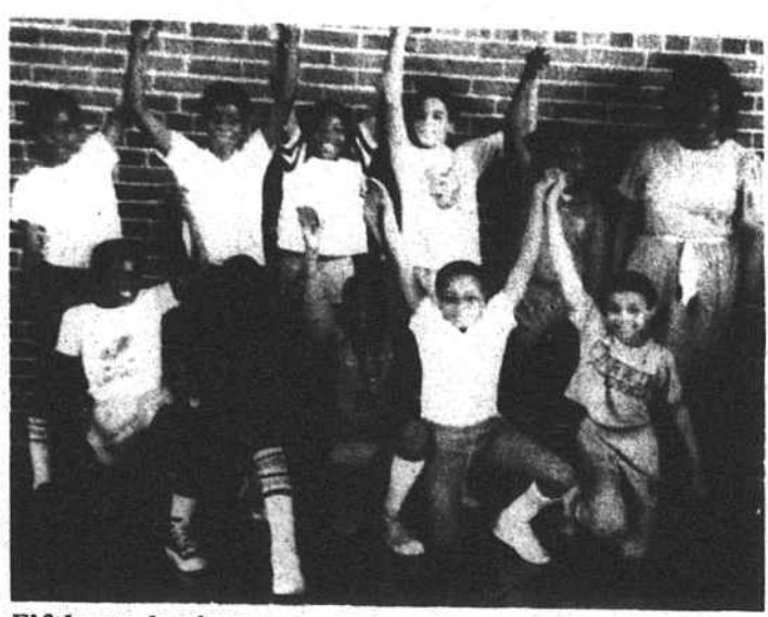
Fifth grade champs Fifth grade boys basketball champs pictured with their instructor Town-