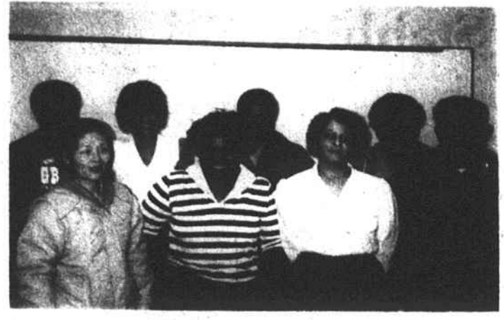
Two years attendance

said. Although the county board remained in executive session for over 45 minutes to discuss a "per-sonnel matter," no action was