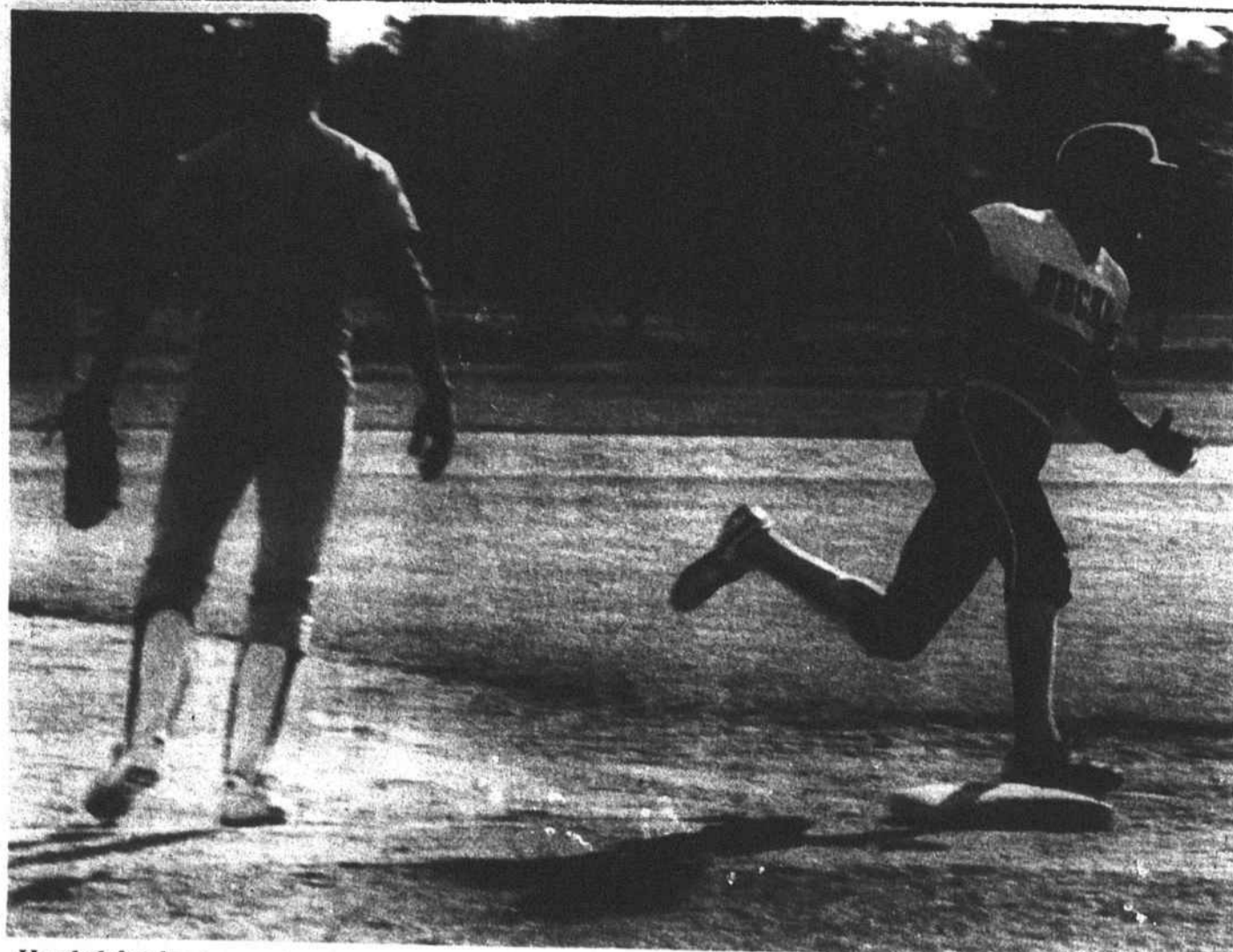
Headed for home This Buck player rounds the bases and heads for home plate during Friday's game against Lumberton. The Bucks lost the game by one

run. The Hoke team is now 0-7 for the season and 0-1 in conference play.