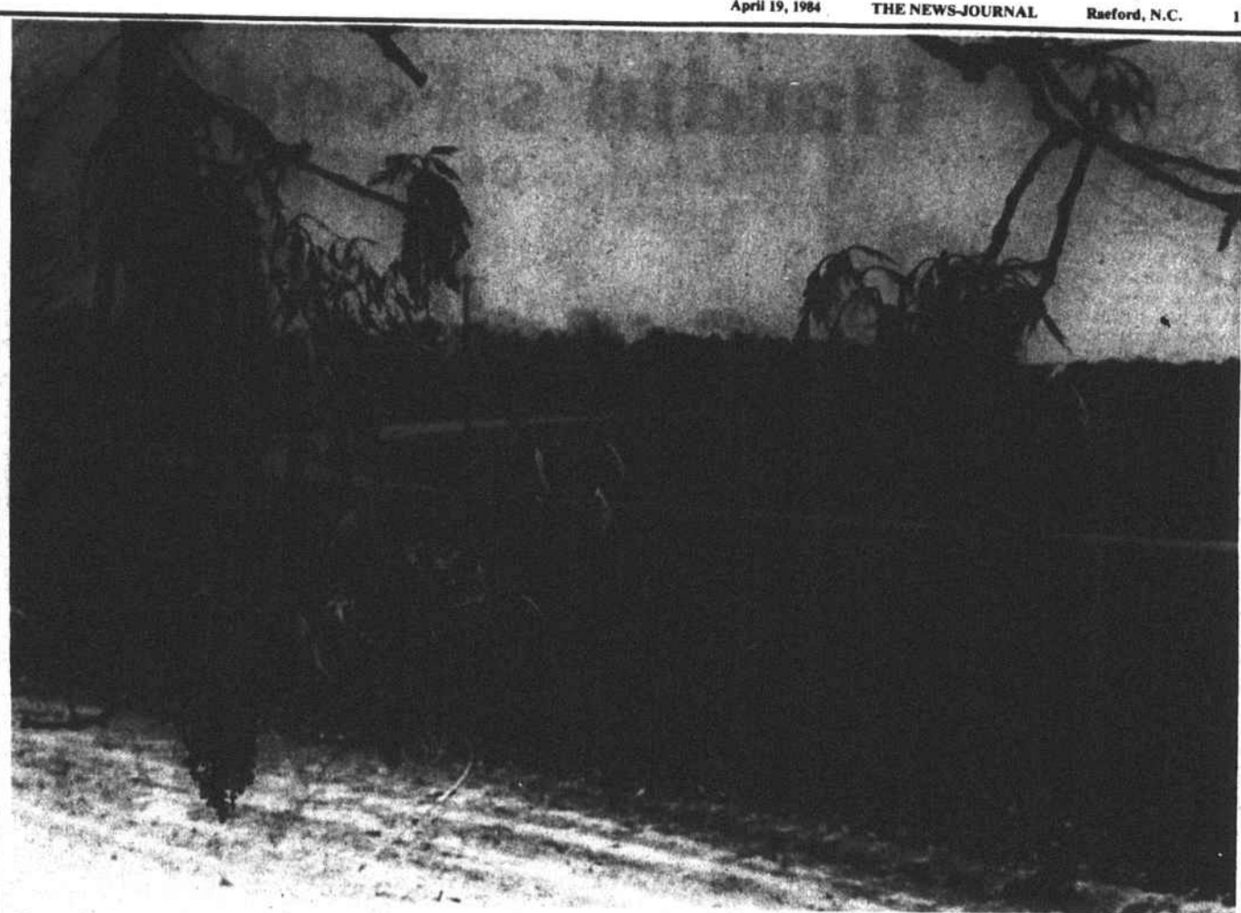
Danglin' beauty Although many persons have probably seen these droopy little items hanging from oak trees in the spring, most do not know that these are