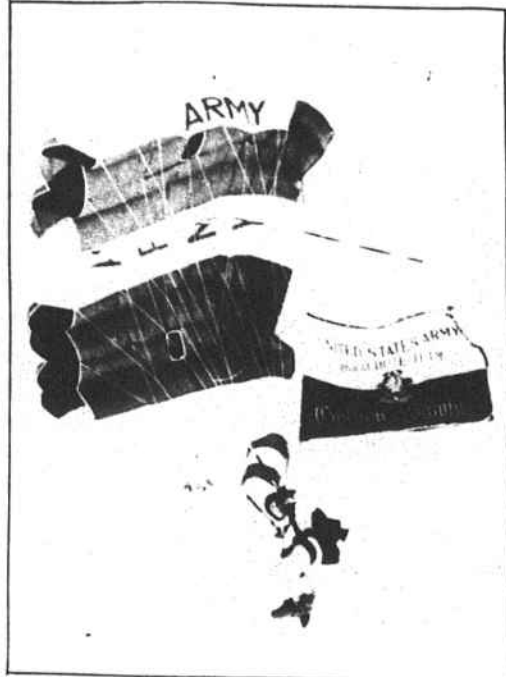
OPEN HOUSE -- The annual Pope AFB-Fort Bragg Open House has been scheduled for April 28 on the Pope flightline. Gates will open at 9 a.m. and there is no charge for admission. Highlighting this year's events will be a precision flying demonstration by the U.S. Air Force Thunderbolts Aerial Demonstration Team from Nellis AFB, Nev., and a parachute demonstration by the U.S. Army Golden Knights Parachute Team from Fort Bragg.

April 19 EASTER PLAY -- Raeford Kindergarten & Day Nursery will present their Easter program Thursday evening, April 19 at 6:30 in the Upchurch School Auditorium. The public is invited to attend.