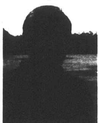
Jack Scarborough -- winner of third flight