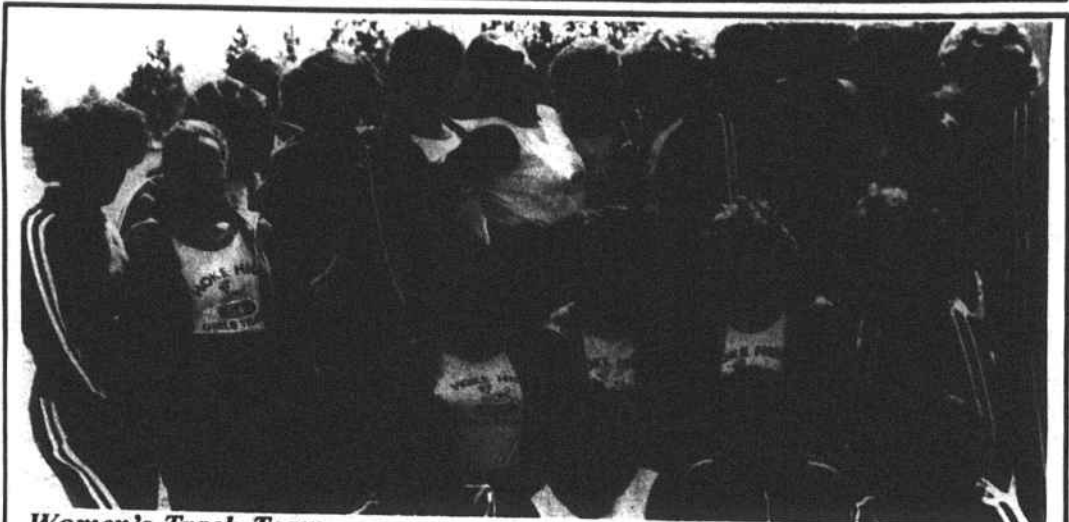
Women's Track Team

"I am really looking forward to developing these girls next season."