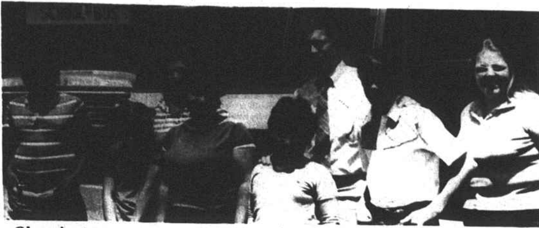
Olympic stars These Special Olympic stars from Hoke County captured two golds, three silvers and four bronze medals during competition at the North Carolina State Special Olympics held last week in Greensboro. The athletes are shown here with the chaperones who accompanied them on the trip.