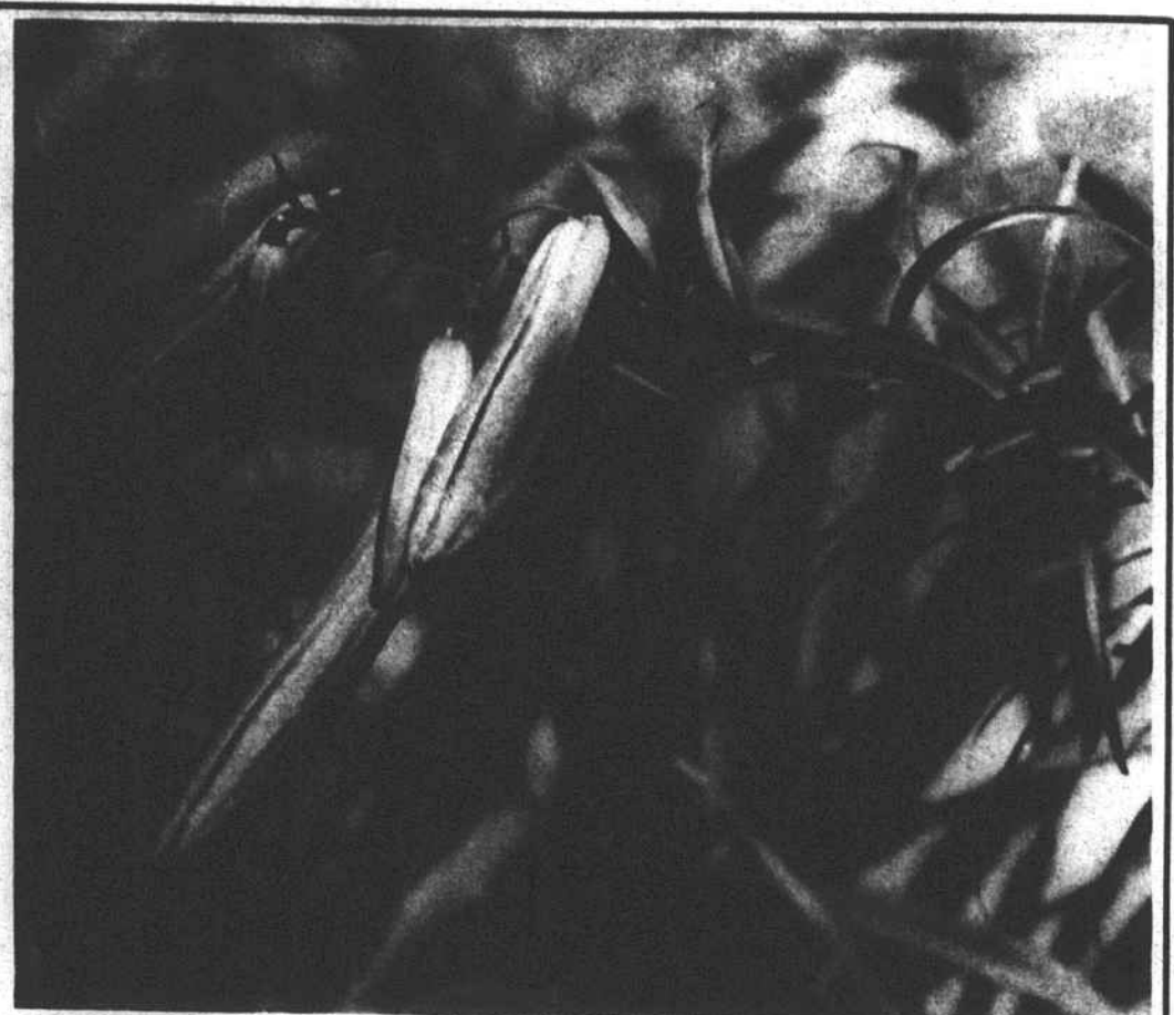
Still blooming Day lilies keep the Hoke County countryside blooming throughout the summer. These local buds seem primed and ready to burst into color.

Oct. 13 FALL FEST - Winthrop College will celebrate its second FallFest on Oct. 13, 1984, with arts, crafts, food, entertainment, and more. Artists and crafts makers may call Winthrop College now for information about reserving a booth for FallFest by calling (803) 323-2279.