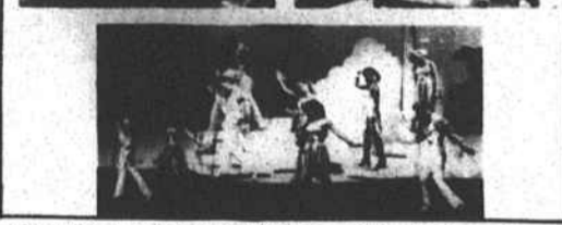
Carowinds is now open Sunday through Thursday from 10 a.m. until 8 p.m., and on Saturdays from 10 a.m. until 10 p.m. Carowinds is closed every Friday except Friday, July 6. Highlighted in this area are the new Sweet's Island (top right), a participatory play area for children, and a new line up of live shows including Celebration (bottom). All of the favorite rides such as the Carolina Cyclone (top left) are in full operation as well.

with a special tribute to the 400th Anniversary of the landing of english colonists on North Carolina's shores in cooperation with North Carolina's 400th birthday celebration, and is widely considered one of the most appropriate vehicles for commemoration of North Carolina's and America's Anglo-Saxon heritage.