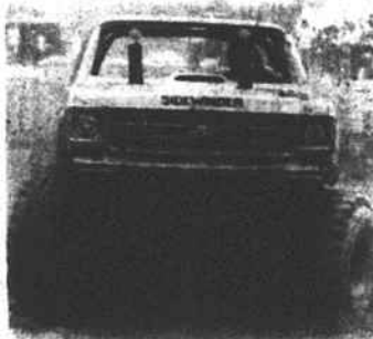
Spinning through Sidewinder spins through the course at Raeford Sand and Gravel during mud rally action Sunday.

He becomes the 18th driver to capture the $2,000 top prize since the competition started in 1980 at the Farmington Dragway.