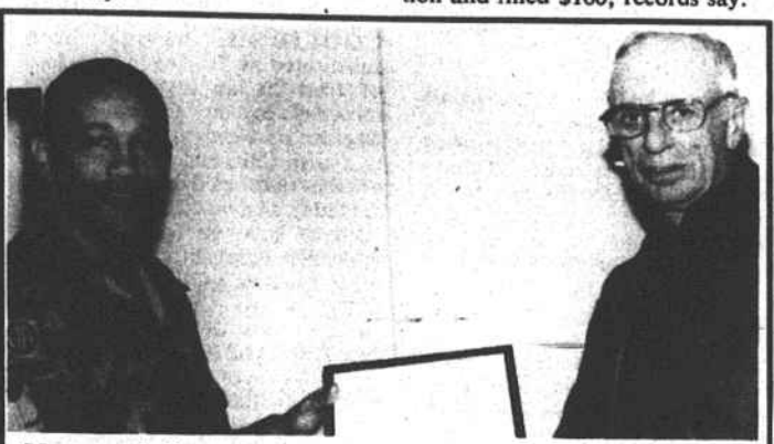
Honored for service

for DWI and possession of mari-According to records, the charges were consolidated and Lunsford, 17, got 60 days suspended for one year supervised proba-tion and fined $100, records say.