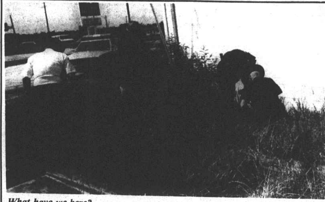
What have we here?

for our country. If you haven't been watching, please do so before the end of the games this week.