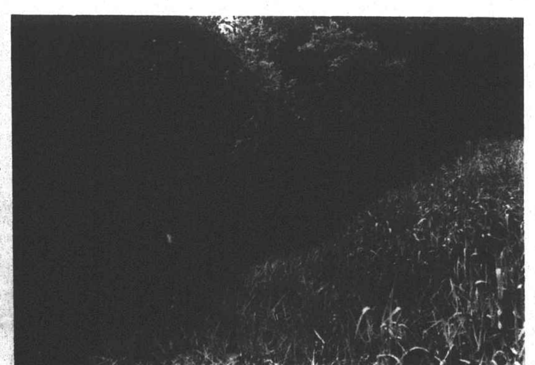
A good place to swim? Although a blt grown up, on the surface, this bend in Rockfish Creek looks like a nice spot for swimming. However, until the bottom is cleared, it is better to