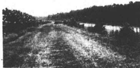
Many farmers are seeing the need for field borders for turn rows and travel lanes with 2800 feet established.