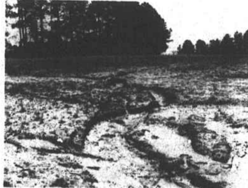
Erosion Control is the District's main objective with approximately 9 tons of valuable topsoil lost per acre each year due to severe erosion from wind and water.