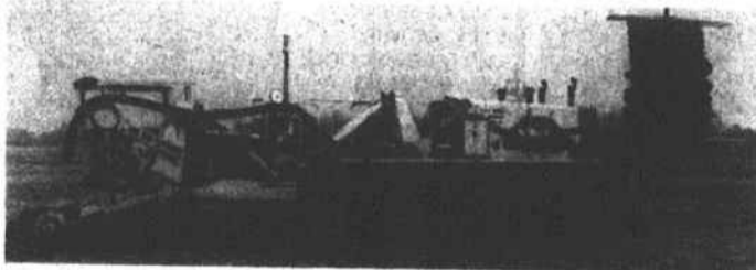
Assistance was provided with 35,000 feet of drain tile.

Sponsored By The Following Businesses Who Support Our Conservation District.