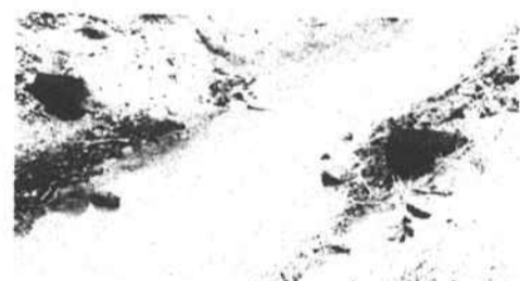
Surface water inlet pipes prevent ditch bank erosion.