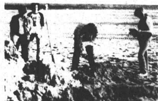
District assisted Hoke County High School with Land Judging contest.