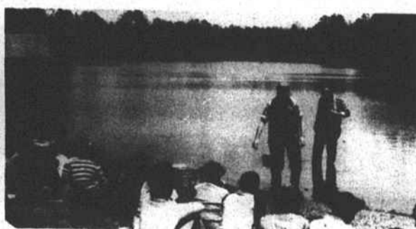
Our First Environmental Field Day was held on April 17 & 18. Approximately 450 students, teachers and parents from Turlington School were taken to Gattin's Pond to learn more about our environment.