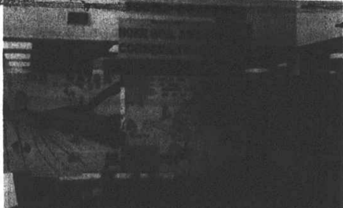
Winning posters were displayed in public library.