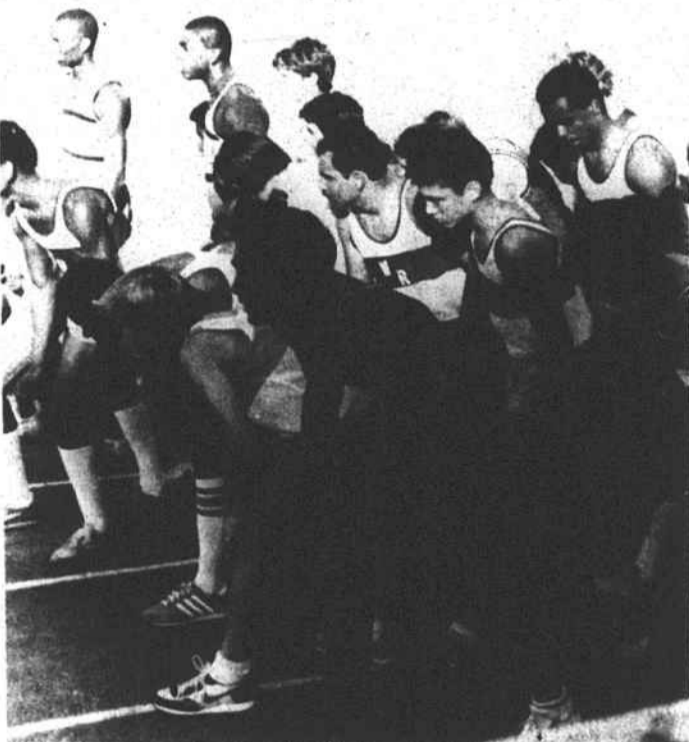
Winning start Members of the Hoke High cross country team line up last week for the start of a four-school race. The Bucks were victorious capturing the fewest points to top Lumberton, West Robeson and E.E. Smith.