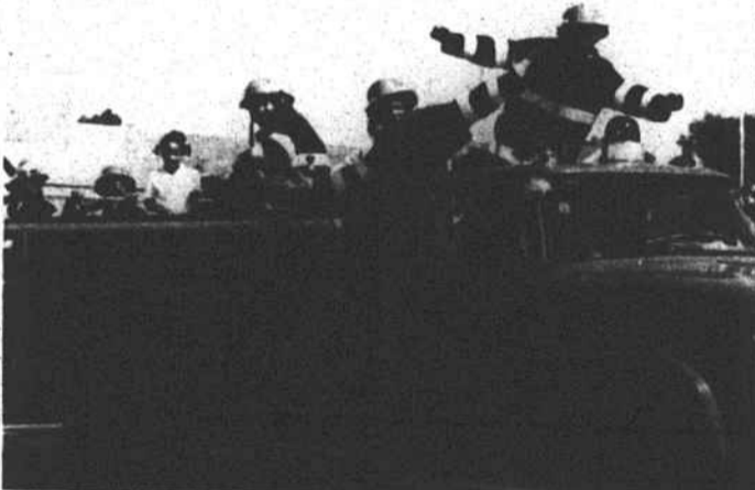
Tylertown routine Tylertown firemen perform during the Fireman's Parade on Saturday.