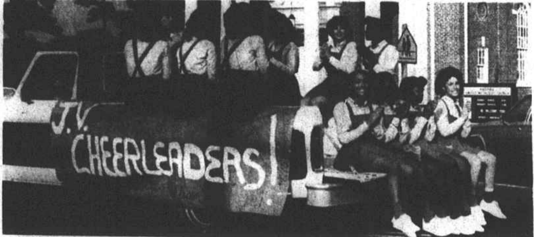
Sparking up the crowd The Hoke High JV cheerleaders do their part to raise the spirits of onlookers during the Homecoming Parade on Friday.