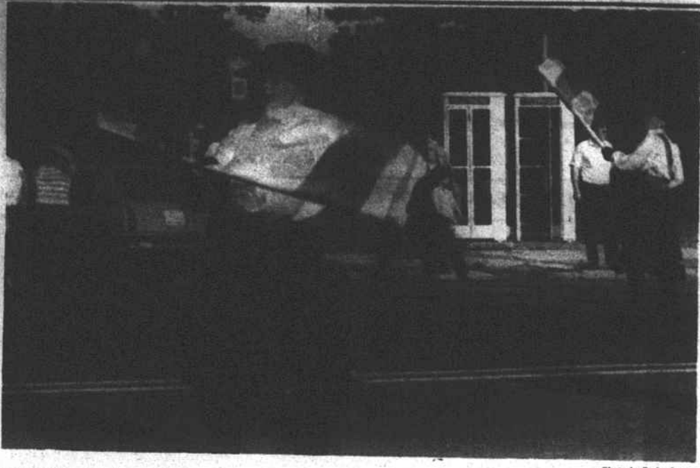
Walking and twirling Leading the parade is not as easy as it may seem; everyone knows when a mistake is made. However, the leader of this parade made no mistakes and the Homecoming Parade last Friday afternoon went off without a hitch.