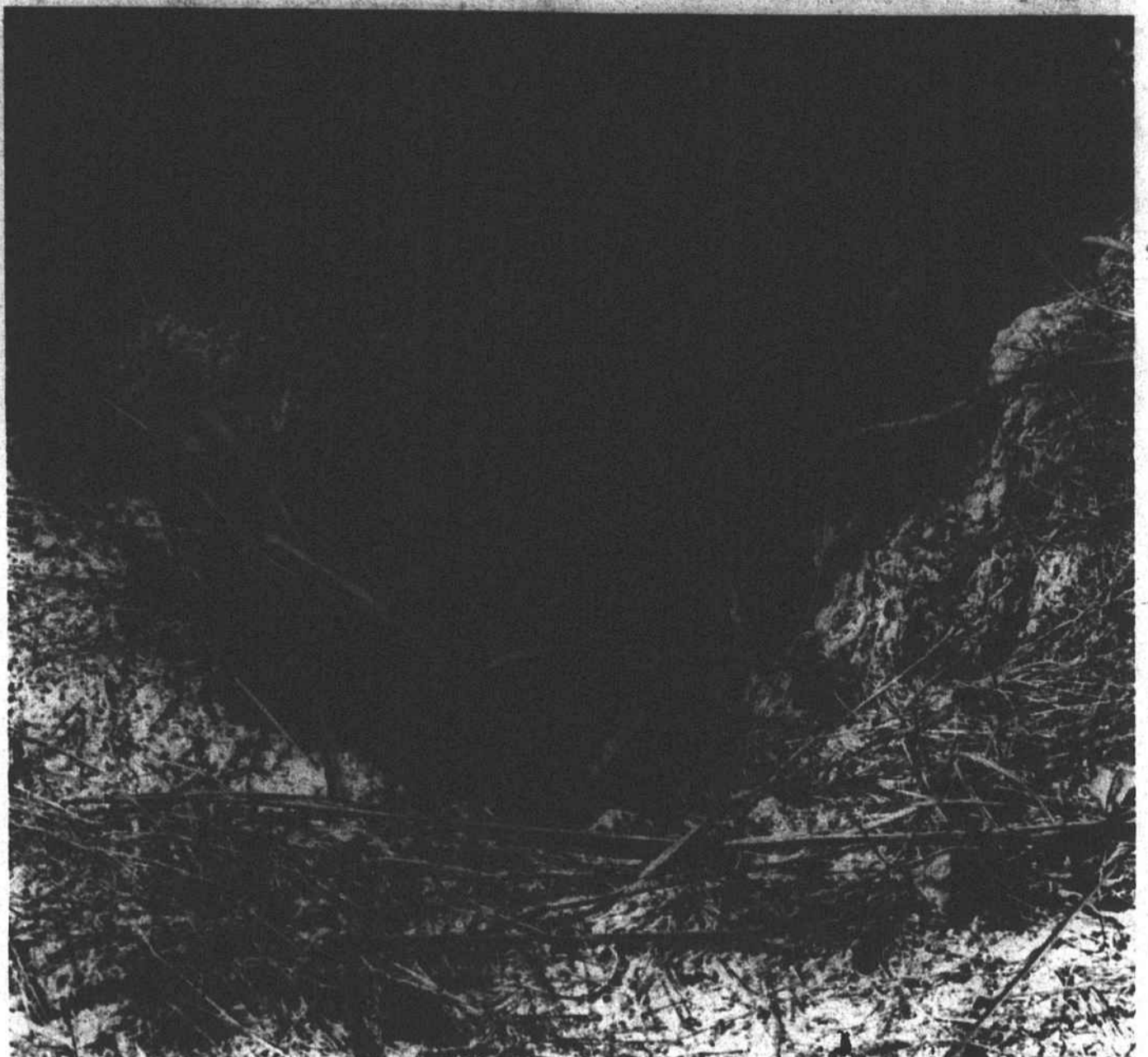
Entrance to the world down-under