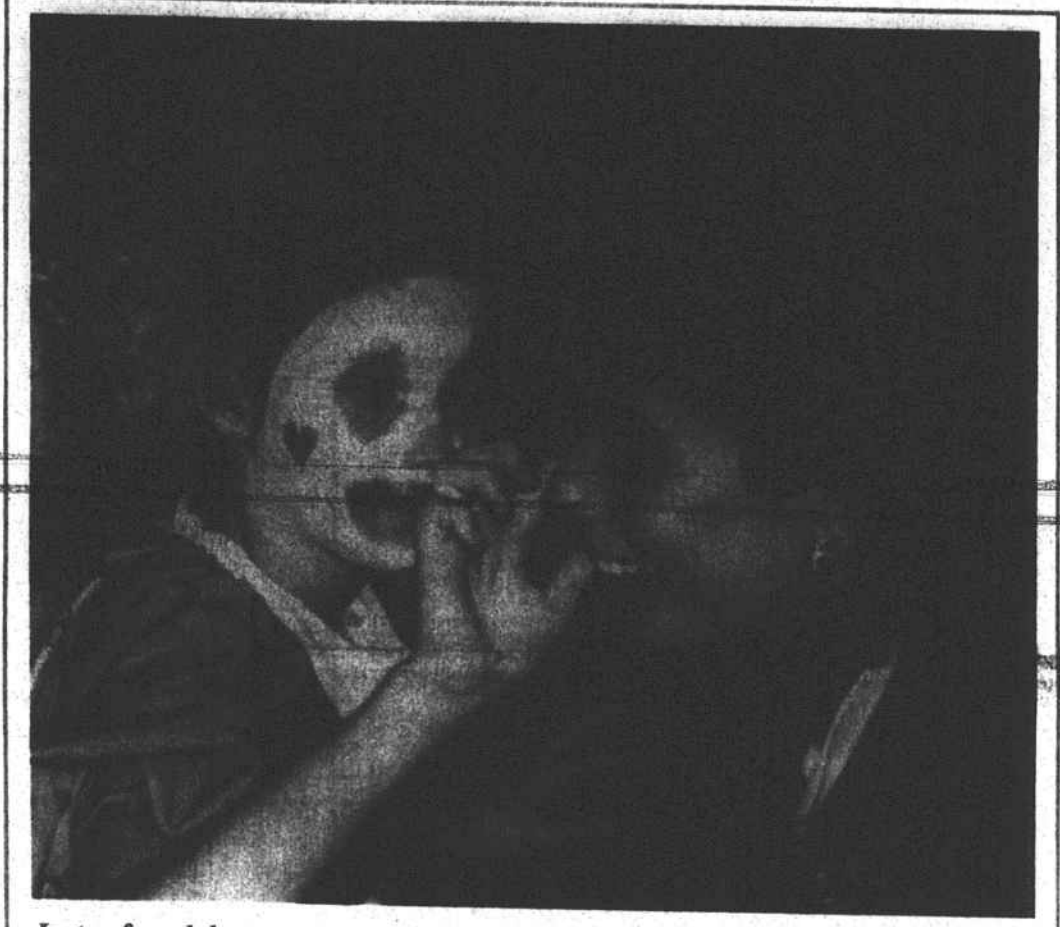
Just a few dabs

"We have found that this (check) (See CRISIS, page 10A)